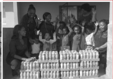
Distributing donations of Tomatoes and Milkshakes to where they are needed