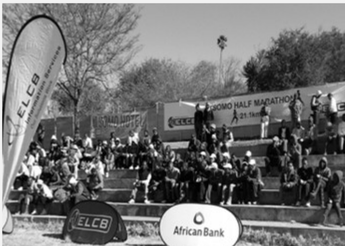
ELCB sponsors Tsomo Community Upliftment Event