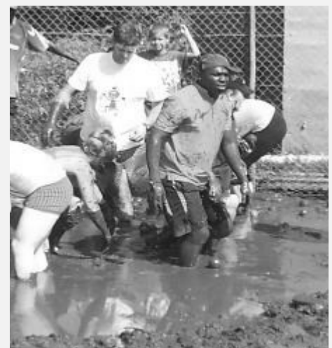
ELCB partakes in CANSA Fund Raising Event

this worthy initiative and participated in this fundraising event. ELCB has been involved on an annual basis since 2014 and sponsors participants as well as providing volunteers and events in the race 🙌.