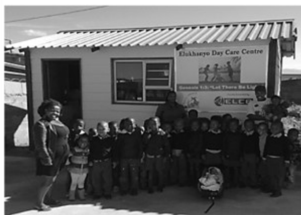
Children at Elukhanyo receive new classrooms and a playground

Elukhanyo day Care Centre between the six months and five years of age. After assessing their small and run-down facilities, ELCB got involved to erect 4 Classrooms to replace the metal shacks the children were housed in.